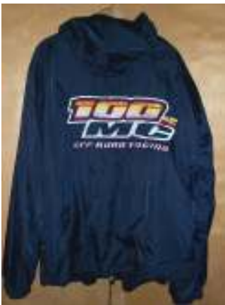
100's MC Jacket (Back)

Come get your 100's merchandise. Start the new year of racing in a new jersey. We have a good supply of club shirts, jackets, sweatshirts and men's long sleeve shirts, we need to move them NOW! Will have the inventory available all weekend at the Checkers MC race. See ya at the Argubrights' trailer.