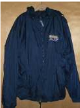
100's MC Jacket (Front)