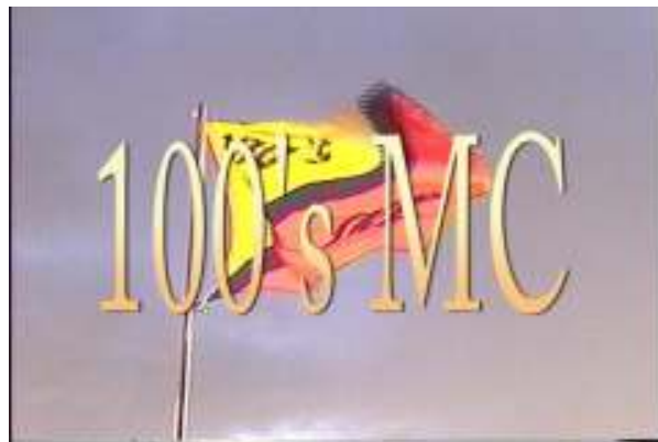
The 100's MC upcoming movie