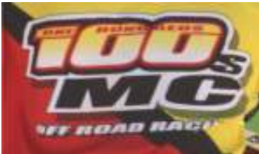
New Race Jersey