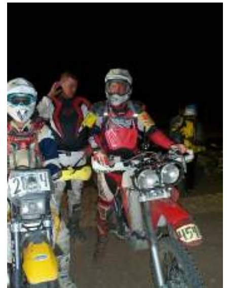
Berry at the starting line!!!!